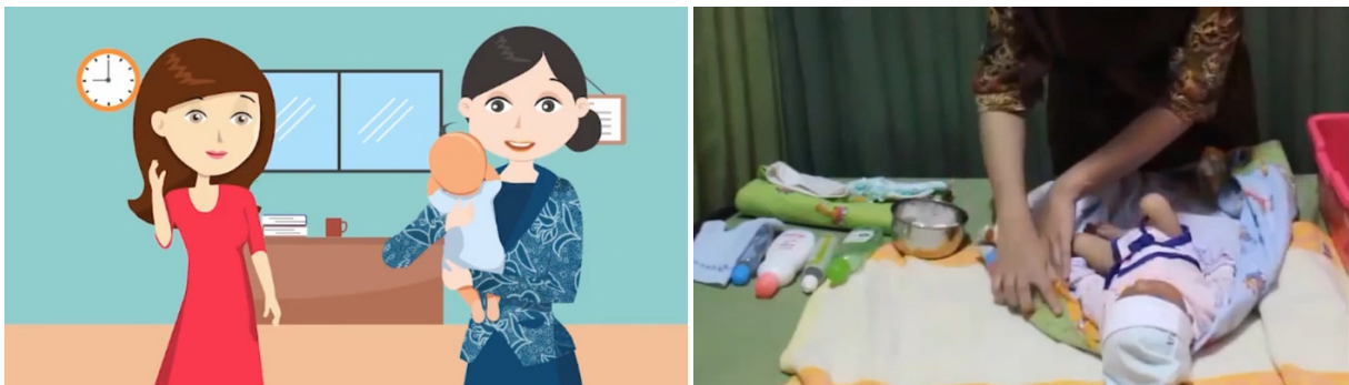
Figure 2 Combination of Animation and Real-life Demonstration of Neonatal Care Videos in the iPosyandu Application

Increasing knowledge about proper and correct umbilical cord care is crucial. 29 In this research, the educational video intervention had a medium effect. Giving examples of good practice through video demonstrations is in line with previous research to increase the knowledge and expertise of mothers in umbilical cord care. 29,30 The schedule of neonatal or newborn visits (0–28 days) provides a corridor for knowledge diffusion. This schedule is one of the main foundations that regulates and supports meeting times for providing knowledge about neonatal care from the midwife to the mother. 31 General knowledge of neonatal care needs to be obtained since the third trimester of pregnancy, including indicators of normal weight from birth. Education to prevent LBW is very important. 32 In addition, immunization arrangements can be integrated with visit schedules and educational