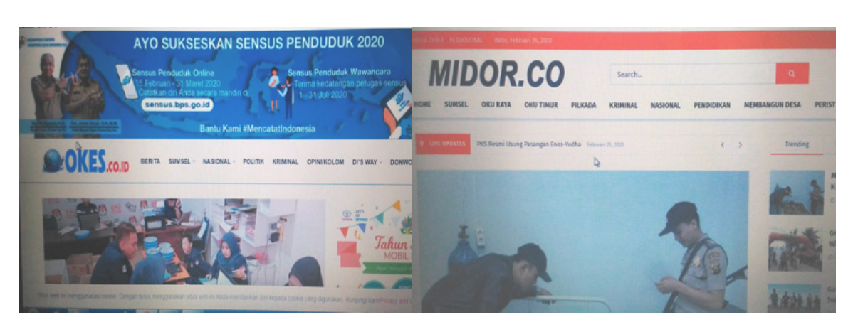
FIGURE 1. Display of Online Version of OKU Ekspres (left) and OKU Timur Pos (right)

Furthermore. to bring OKU Ekspres and OKU Timur Pos into multimedia. local. multichannel and multiplatform mass media, the management and editor in chief continue to strengthen the carrying capacity of technology (computers, information smartphones) photo cameras, adequate internet network capacity. The capacity of journalists, as "man behind the gun", is also being encouraged. To accelerate convergence, journalists are not only required to have the ability to use technology but also to sharpen sensitivity, journalistic ability, artistic ability, and point of view in covering, recording, writing, and reporting multiplatform journalistic events in-depth and with quality. Therefore, in maximizing the choice of convergence, OKU Ekspres and OKU Timur Pos editors position the two local newspapers as multimedia, multichannel and multiplatform mass communication channels. Transformation and synchronization between the printed version and the online version through