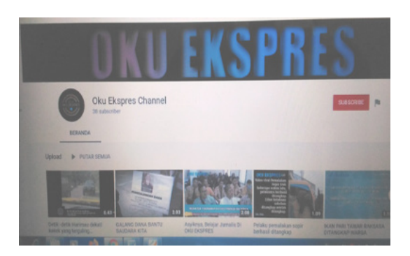
FIGURE 3. Display of OKU Ekspres YouTube Channel

Why has public media relations become so important? If you look at