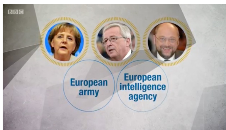
FIGURE 3: Future of European Union

The BBC explained that the UK joined the European Economic Community in 1973 (minute 00:15-00:22). The UK stayed a member based on the 1975 referendum results, in which 67% of the population supported the membership (minute 00:23-00:32). According to the BBC editorial team, the EU was formed in 1993 as a political and economic union (minute 00:33-00:47). It introduced a one currency program that