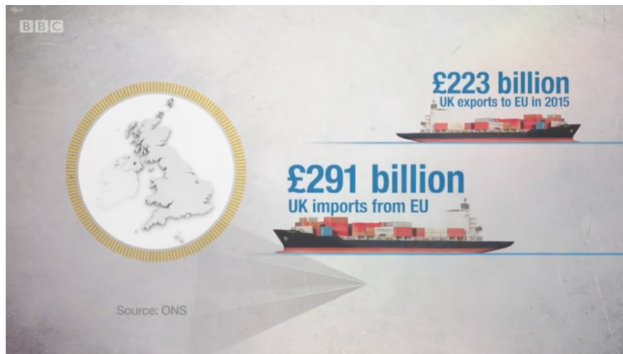
FIGURE 1. UK's Trade Deficit

campaign will impose tariffs on the EU after Brexit.