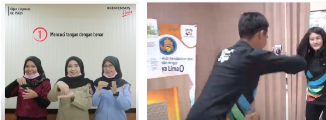
FIGURE 2. Video Footage of Covid Prevention Socialization through TikTok