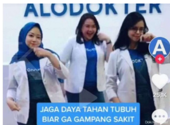
FIGURE 3. Educational Video Footage “Maintain Body Resistance” through TikTok