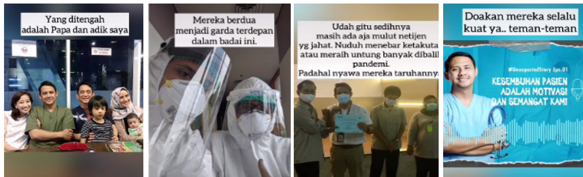
FIGURE 4. TikTok Video Visualization of Someone’s father and brother as the First Research Object