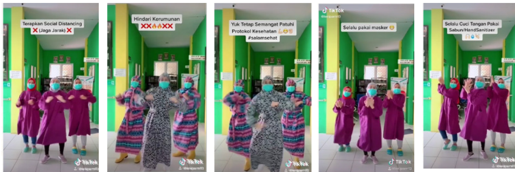
FIGURE 6. TikTok Video Visualization of The Health Worker in combating the Covid-19 as the third research object

motifs, (f) A fourth message appears, namely “Avoid the crowd XX, there is an image of the fire symbol XX”, (g) The fifth or last message that appears is “Let’s Keep the Spirit to obey the Health Protocol with a symbol of enthusiastic hand and emoticon of wearing a mask and #salamsehat”.