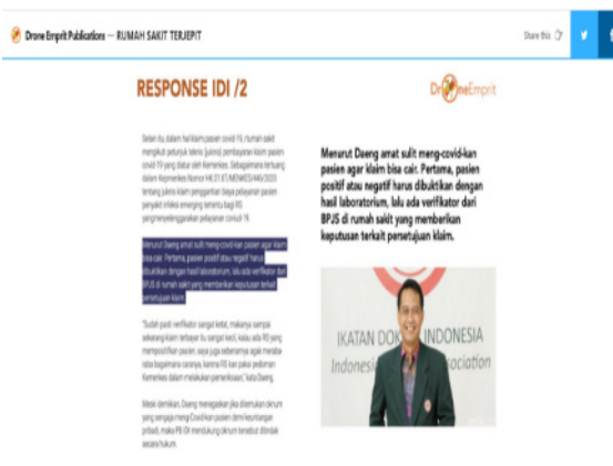
FIGURE 5. response from IDI regarding #bongkarmafiaCovidRS (2)

When studied and reviewing these issues and review of various media online as well as the policies of the government, especially the Ministry of Health of the Republic of Indonesia, related to the role of hospital and health personnel in the handling of the pandemic Covid-19, it can describe some points as follows : 1) Regarding the circulation of the hospital mafia issue related to the actions of hospitals that offer patients, this has been responded by the Indonesian Doctors Association (IDI) (FIGURE 4 and 5), the Association of Indonesian