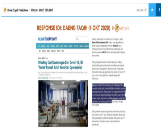
FIGURE 4. response from IDI regarding #bongkarmafiaCovidRS (1)

statement of the head of the KSP while in Semarang , Some areas that allegedly taking advantage of the pandemic to increase budget requirements with references from source.com, Bantennews.co.id, Bisnis.com: IPW’s statement about the alleged Covid-19 game by the hospital mafia , allegedly there is a rogue hospital for the sake of the corona budget in Ciamis, Pasuruan, Jambi and several other cities with references from Kompas TV: Banggar DPR, there are public reports in many WhatsApp groups , There are hospitals that testify sick people who are not actually infected with Covid, with references from Bisnis.com: IPW statement, Neta S Pane asks the Police Criminal Investigation Unit to dismantle RS mafia , Regarding the meeting between the head of the KSP and the Governor of Central Java, discussing “the hospital should not carelessly coveded all patients who died during the pandemic “refer to data on the death of Covid-19 patients from each hospital and public unrest on WhatsApp, social media, with references from beritasatu.TV and bantennews.co.id: K SP in an interview at beritasatu and IPW Statement asking for Crime The National Police, the prosecutor’s office and the Corruption Eradication Commission (KPK) dismantled the hospital mafia (FIGURE 6).