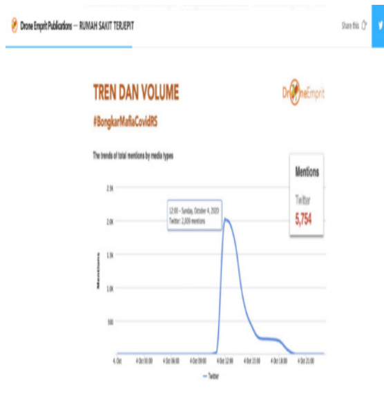
FIGURE 2. The trend and volume of the #bongkarmafiacovidrs conversation Source: ( droneemprit.id, 2020 )

On the other hand, Indonesia Police Watch (IPW) also commented on the issue of value associated with the costs that must be borne by the government for one covid patient within 14 days of treatment with the assumption of Rp. 105 million (lowest cost), and Rp. 231 million for patients with complications. IPW even asked Bareskrim to investigate and audit all Covid-19 referral hospitals to find out how many victims actually died due to Covid-19 and how many patients were Covid-19.