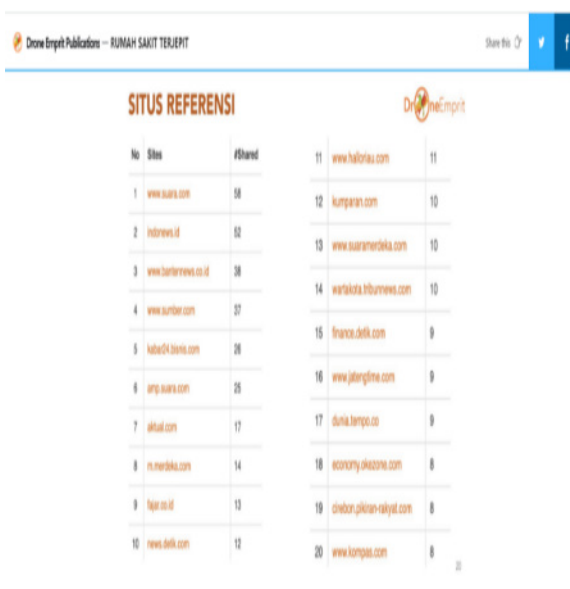
FIGURE 6. #bongkarmafiaticovid19 tweet reference site in the media

Regarding the accusation that the hospital mafia has coviding patients to take advantage, of course this requires concrete evidence because submitting a patient's claim must pass detailed verification. The Chairman of the Association of Indonesian Hospitals (PERSI) emphasized that the hospital had followed the procedure for submitting claims for Covid-19 patients, so the news about hospitals finding patients was not true. Submission of claims for covid-19 patients is proven by clinical assessments, medical resumes, laboratory examinations and other supporting data and this has been stated in the Decree of the Minister of Health number HK.01.07