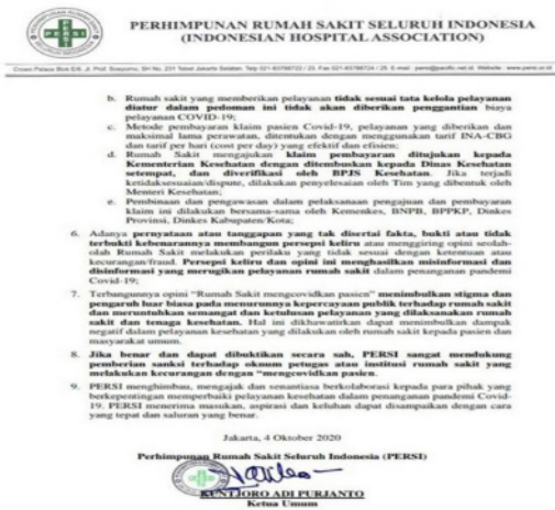
FIGURE 8. PERSI’s public statement regarding the accusation that the hospital coviding patient (p.2)

baseless accusations. This is certainly reasonable for people in the field to put forward, as if they have worked hard with clear instructions and in accordance with procedures, but are still accused of doing things that are not in accordance with the procedure. Of course this has an impact on the image of the hospital.