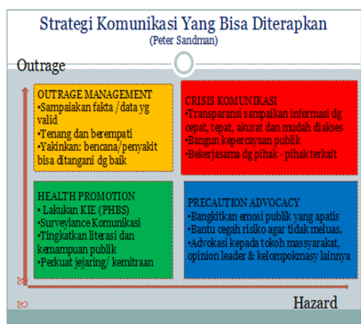
FIGURE 11. Communication strategy to customers

a lot of noise in the news and in the beginning the government wasn't ready to counter it. Everyone talks about health from just forwarding the message to even adding to the message and some are incompetent especially in the media of friendship like WA Group which can add to the problem. Everyone suddenly wanted to talk and become "experts" at the problem. In communicating, a communicator should know who he is, who are the opponents he invites to communicate and also understand good communication science.