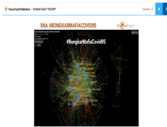
FIGURE 3. Citizen discussion traffic with #bongkarmafiacovidrs Source: ( droneemprit.id,2020 )