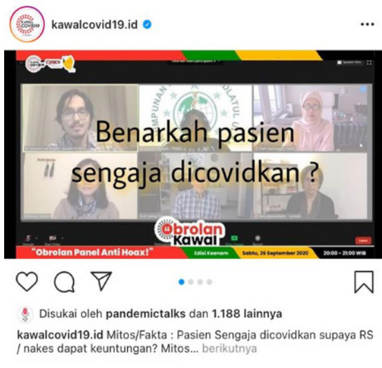
FIGURE 9. study related to the accusation of coviding patients with health community and observers (Instagram@kawalcovid19.id, 2020)

A positive image for an institution such as a hospital is an important thing that needs to be maintained, because the hospital is a public facility for the community to obtain health services. A hospital that does not have an image