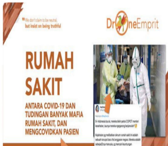
FIGURE 1. Narrative analysis of hospital issues and acusations to the hospital