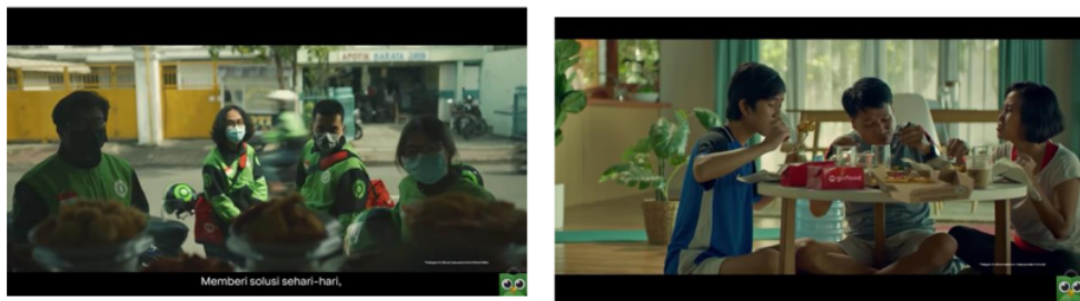
Figure 1. Gojek Driver Delivering Food

The introduction advertisement done by GOTO with the title "Gojek and Tokopedia introduces GoTo" is a commercial advertisement, the duration for this advertisement is 1 minute and 56 seconds. In the video, Gojek and Tokopedia tell us the story of the initial experience in forming these two startups. It started with no one seeing it until finally having an impact on many lives in Indonesia. This video tells us the story about the digital transformation that Gojek and Tokopedia have carried out in helping aspects of people's lives in Indonesia and from the start, Tokopedia and Gojek alone are companies that are connected with services offered by Tokopedia are Marketplace UMKM which means they get to sell things online and the things sold online are sent by a courier or a Gojek driver. A few examples illustrate a Gojek driver delivering food for a family in this era of the Covid-19 pandemic, thereby reducing the space for the spread of the Covid-19 virus itself. The practicality given by Gojek is also illustrated in this video of how Gojek provides a solution to existing problems.