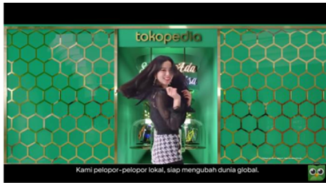
Figure 2. Tokopedia and Gojek in the International Scene

Combining various audio and visual elements, GoTo's video tries to show a cultural message that is "Gotong Royong" which is the culture of Indonesia. In this advertisement video, GoTo always shows the culture of gotong royong in several video scenes. This in-depth review of GoTo's introduction advertisement is gonna be discussed through the value dimension based on Hofstede's theory. Researcher will parse these various dimensions through a description for each scene that is in the Tokopedia and Gojek advertisement titled "Gojek and Tokopedia introduces GoTo." In the discussion of this scene, researchers will give an analysis based on the cultural dimensions of Power Distance.