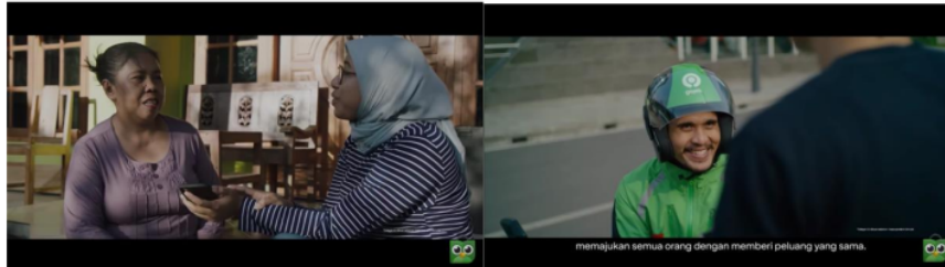
Figure 3. Scenes for Minute 1:15 and Minute 1:35

Combining various audio and visual elements, GoTo's video tries to show a cultural message that is "Gotong Royong" which is the culture of Indonesia. In this advertisement video, GoTo always shows the culture of gotong royong in several video scenes. This in-depth review of GoTo's introduction advertisement is gonna be discussed through the value dimension based on Hofstede's theory. Researcher will parse these various dimensions through a description for each scene that is in the Tokopedia and Gojek advertisement titled "Gojek and Tokopedia introduces GoTo." In the discussion of this scene, researchers will give an analysis based on the cultural dimensions of Power Distance.