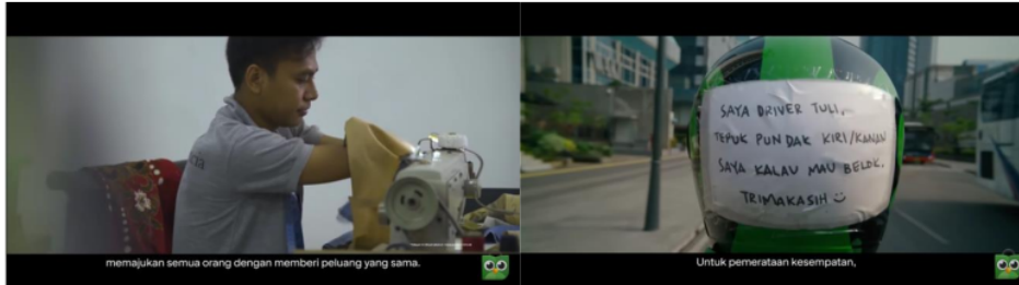
Figure 6. Scene from minute 1:33 and Minute 1:36

In the next scene, it can be seen that the Uncertainty Avoidance that occurs is in ethnic and religious differences, but these differences do not make it a problem or obstacle. The uncertainty that exists also comes from the existence of people who have physical disabilities where the digital transformation brought by Gojek and Tokopedia doesn't make people with limitations be discouraged but instead opens up a new job opportunity. This uncertainty becomes something positive, which you can see in Figure 6 below.