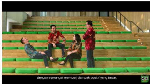
Figure 4. The scene for Minute 1:13 and Minute 1:40

In Figure 4 below shows that the culture from "Gotong Royong" clearly illustrates that both the internal and external workers hold discussions together. The collective values displayed shows that the Indonesian community accept, take care of each other, and move towards a common interest (Jatmika, 2018). In this scene, it can be concluded that GoTo wants to emphasize the concept of cooperation between each other and achieving success in the future. In scene 1:13, we can see that the CEO from Tokopedia is seen chatting with his Tokopedia teammates in a more relaxed manner, so the picture they want to show is the importance of cooperation between leaders and company members that will create good performance in order to achieve success and for Gojek itself can be seen in scene 1:40 that the driver-partner talked with the CEO of Gojek casually, listening to the opinions from every Gojek member to be able to develop the company in a better direction.