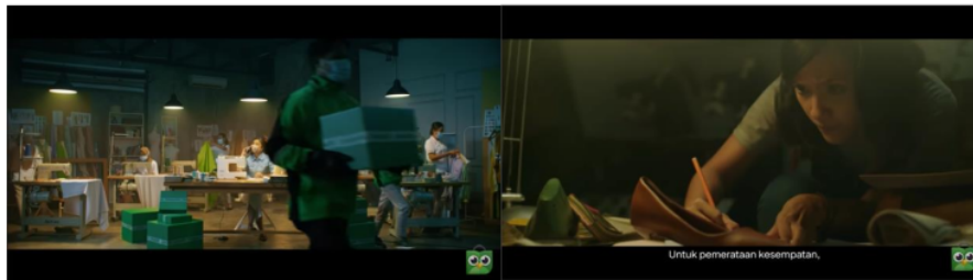
Figure 5. The scene for second 00:19 and minute 01:32

In Figure 4 below shows that the culture from "Gotong Royong" clearly illustrates that both the internal and external workers hold discussions together. The collective values displayed shows that the Indonesian community accept, take care of each other, and move towards a common interest (Jatmika, 2018). In this scene, it can be concluded that GoTo wants to emphasize the concept of cooperation between each other and achieving success in the future. In scene 1:13, we can see that the CEO from Tokopedia is seen chatting with his Tokopedia teammates in a more relaxed manner, so the picture they want to show is the importance of cooperation between leaders and company members that will create good performance in order to achieve success and for Gojek itself can be seen in scene 1:40 that the driver-partner talked with the CEO of Gojek casually, listening to the opinions from every Gojek member to be able to develop the company in a better direction.