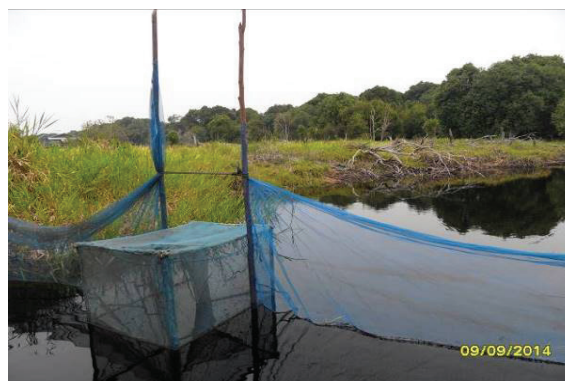
Figure 3. Trap Fishing Gear Used by Fishermen; a) Lukah Tali to Close the Estuary of the Small Size Lake, B) Fishermen were being Held Up Hambat in Tasik Serai