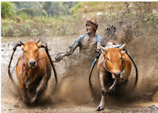
Figure 7. Traditional event "pacujawi"