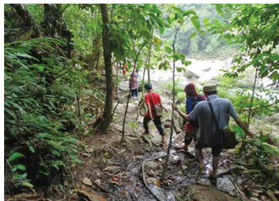
Figure 5. Road to tourist site

West Sumatra also has a rich potential of flora and fauna resources which can be developed as agro-tourism destinations such as endemic bilih fish in singkarak lake, or grassland tourism and cattle ranch in Padang Managateh , Limapuluh Kota.