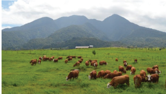
Figure 6 Grassland tourism in Padang Mangateh

and international event. In rural tourism, the "sense of place" is a fundamental element in both tourists and host community's feelings of what makes the area attractive to visit and live in. This sense of place is maintained partly through pacu jawi attraction which plays a vital role in preserving Minangkabau's heritage.