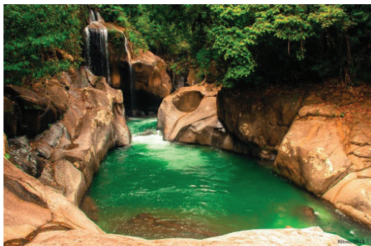
Figure 2. Waterfall

The potential Agro-tourism in West Sumatera can be classified into three resources: (a) Natural resources tourism; (b) Flora and Fauna resources tourism; and (c) Socio-cultural resources tourism. Natural resources tourism is more prominent in great natural resources, such as waterfall, caves, rice terraces, natural forests, and many more.