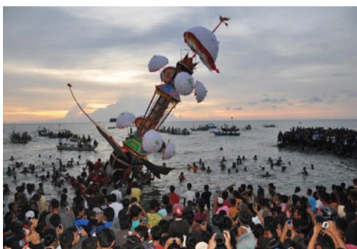
Figure 8. Traditional event "Tabuik"

Tabuik is a cultural event which held every year in Pariaman , West Sumatra. This