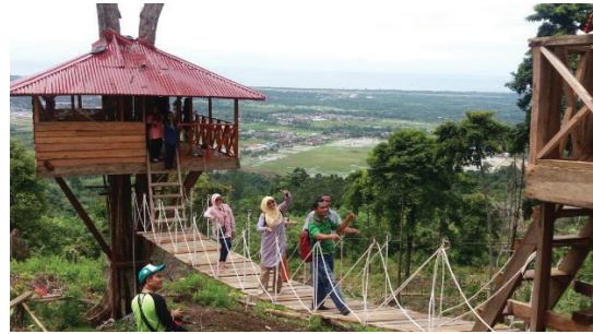
Figure 4. Forest

is far from the local people's house and has a lack of infrastructure and facilities, less affordable, and no road access.