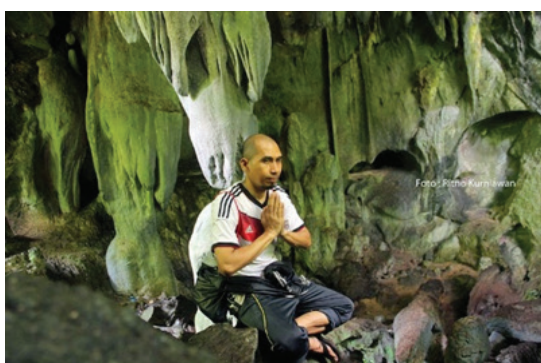
Figure 3. Caves

The natural potential owned is still very original and have difficult route since there is no access road that can be passed by public transportation. Agro-tourism based on natural attraction such as waterfall, forest, and cave