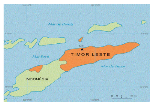
Figure 1. State Border Map of NKRI-RDTL

the construction of unfinished infrastructure and the rampant illegal activities and security guarantees, especially in East Nusa Tenggara province which calls for a stable conducive area.