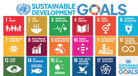
Figure 1. SDGs

harmony is an important key to the life of the nation and state.