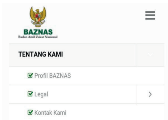
Figure 1: Baznas Profile

Figure 1 is the institution profile. In the institution profile, Baznas presents information about Baznas Profile, legal, contact us.