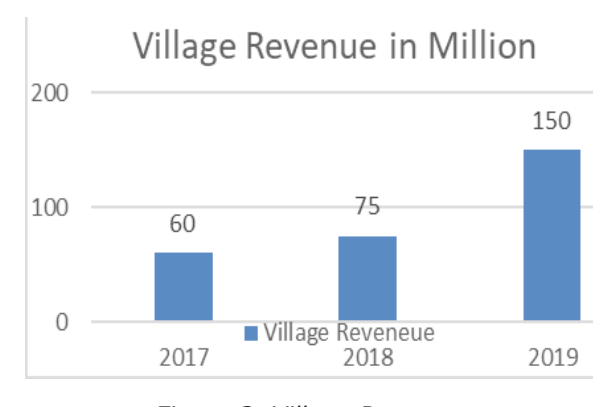
Figure 3. Village Revenue

It needs to note that the researchers only want to see the impact of the Covid-19 pandemic on local tourism, people's income, and local government's revenues; while the development of local tourism is growing rapidly yet stopped by the pandemic. The Mangunan tourism development has a positive impact on society's income such as increased income from tourist destinations in Mangunan village or tourism starting from the tourism service, trade sector, and so on.