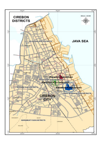
Figure 2.The Position of Keraton Kasepuhan, Keraton Kanoman, and Keraton Kacirebonan

The palaces in Cirebon become tourist destination objects. Palace rooms and buildings still become tourist attraction, because of the unique shape and history of the building. The palace spaces in Cirebon are located close together as shown in the following figure 2. In addition to the location of the palace, there is the tomb location of Sunan Gunung Jati which is located in the northern part of the palaces. The distance from the palace to the tomb of Sunan Gunung Jati is 7 km away.