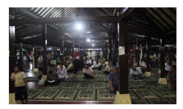
Figure 1. Muludan event visitors (panjang jimat) in Keraton Kasepuhan. Waiting for a panjang jimat ceremony in Sang Cipta Rasa Mosque.

The palaces in Cirebon have a history related to the spread of Islam in the western part of Java. The image of Sunan Gunung Jati as the spreader of Islam and the king of the Cirebon Sultanate is still inherent in the minds of the people today. His figure as a holy man and bringing the blessings of life to the ummah is still inherent in the people of Cirebon. The existence of evidence such as tombs, buildings, kings and their descendants made the figure of Sunan Gunung Jati continue to live in the Cirebon Palace until now.