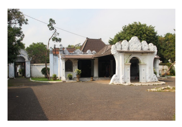
Figure 3. Kuta wadasan Building, the front side of the main building of Keraton Kasepuhan decorated by ancient plates.

Siti Inggil room. Keraton Kasepuhan has a wider Siti Ingil room compared to the Keraton Kanoman room. Palace rooms and buildings with the characteristic of the walls with ancient plates of the past are still the main attraction of tourists until today (see figure 2, figure 3).