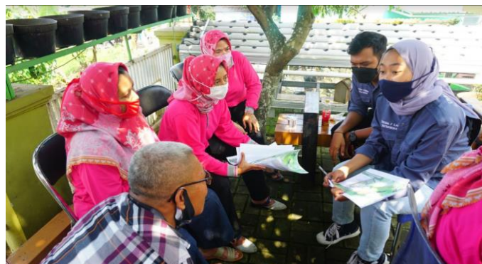
Figure 7. The design assistance process in FGD.

In terms of adapting to changing times, the concept of co-working space reflects the openness of the Ujungberung community to foreign concepts. Co-working, which has been known as a communal workspace for the creative industry for the younger generation, has been redefined by the residents of Pasanggrahan as a place to collaborate and work together with elements of the local community in preserving nature and local culture. Thus, it also reflects the creative spirit of the Ujungberung community with the use of urban space.