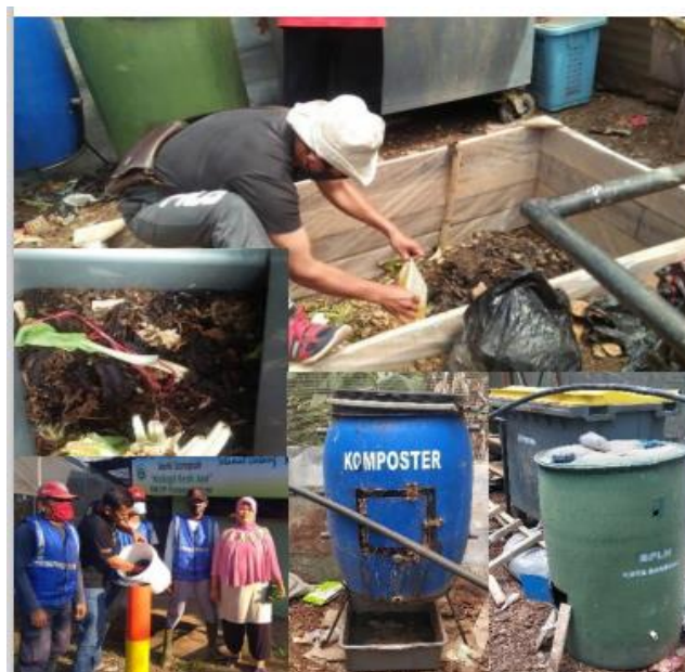
Figure 5. Waste Processing Activity in Kampung Hejo SAE

Other activities related to the implementation of a green city in Kampung Hejo SAE are the construction of greenhouses and vertical gardens as green buildings and the provision of props for biodigesters and processing of waste into oil obtained through corporate social responsibility (CSR) in 2016. This program includes assistance from the Bandung city government in the form of (1) Assistance for waste processing facilitator of Kang Pisman (municipal waste reduction program) to train residents; (2) The cost of the waste processing stimulant for three months including two operators of waste processing; and (3) organic waste equipment in the form of loseda (organic waste composting hole), magot and open windows.