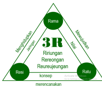
Figure 2. Social Characteristics and Values of Pesanggrahan Village Community

Apart from traditional Sundanese values that hold dear, the people of Ujungberung have an openness to more contemporary culture. This is especially evident in the younger generation where metal rock music is very popular in this group. The Ujungberung metal community is one of the most well-known communities in Indonesia for metal music fans because of their fanatics. This proves that Sundanese cultural values are practiced with a high degree of openness and can embrace foreign cultures without compromising the noble values that have been held for a long time.