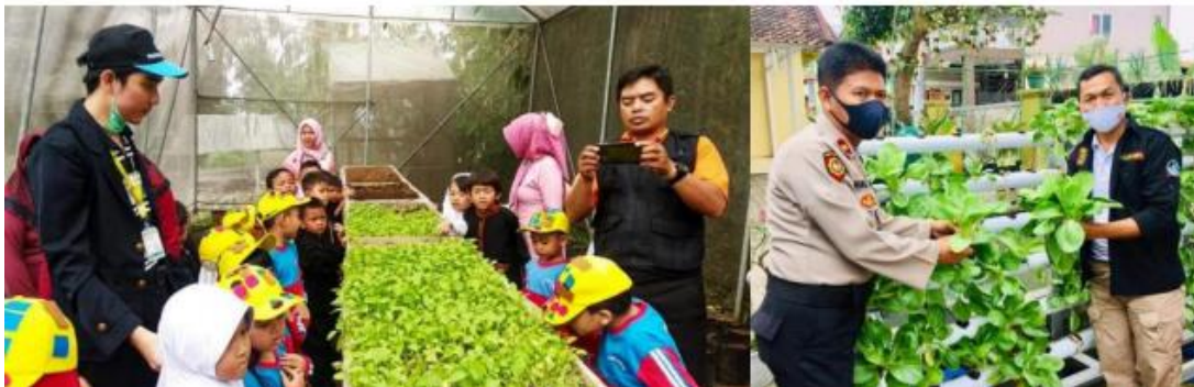
Figure 4. Urban farming in Kampung Hejo SAE

community garden has been visited by many schools, agencies, women empowerment groups (PKK), green communities, and even national level officials.