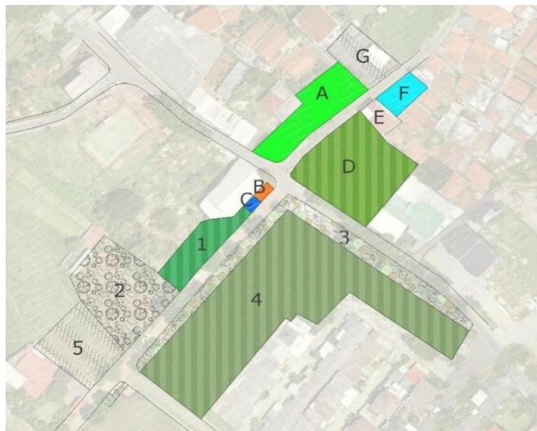
Figure 6. Mapping of Kampung Hejo SAE Existing and Proposed Programs

The design of Kampung Hejo SAE must also be able to respond to the Resilient City paradigm to be able to develop in an era that is constantly changing (Bizzotto, Huseynova, & Estrada, 2019). The presence of the COVID-19 Command Post which has the achievement of being the 1st Winner of the Tangguh Lodaya Environment at the Ujungberung District level is the capital to develop the concept of the resilience of Kampung Hejo SAE into an embodiment of Health Resilient City that allows a community to continue to thrive in a health crisis (Shelter COVID-19 Support team, 2020). How these activities can fit into the space available should be studied in site planning and design in the later stage. The design should consider the amount of space needed, flexibility of use and spatio-temporal arrangement of the activities that are accommodated.