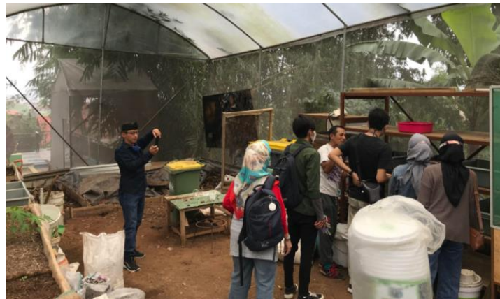
Figure 3. Wallagri Resik, waste bank located in Kampung Hejo SAE

Kampung Hejo SAE (Sehat, Aman, Ekonomis) has long been used as a collaborative space between Pasanggrahan's community groups. One of the most well-known is the Wallagri community, which is the main partner of the study. Since its establishment in 2005, Wallagri as a local community-based organization has acted as a glue for the assets of the Pasanggrahan community. Currently, Wallagri has become a collaborative space for 30 community empowerment groups in various fields, such as: (1) Wallagri Asri urban farm; (2) Wallagri Asih PAUD (pre-school and daycare); (3) Abatasa School (elderly Al-Qur'an literacy education); (4) Wallagri Creative Craft which has been equipped with a storefront space and is now leading to the development of a marketplace; (5) Independent Cooperative Wallagri; (6) Wallagrimart which sells plant seeds; (7) Wallagri Resik (Waste Bank); (8) Wallagri Seni Lestari (jaipong dance studio, karawitan, and angklung); etc. These various groups have formed an intricate social and economic network between their members, so it's nearly become a self-sustained ecosystem. Some members reported paying their pres-school tuition for their children by working in Wallagri's urban farm or teaching in the art studio. This exchange of economic transactions is possible because all these empowerment groups are under Wallagri's umbrella.