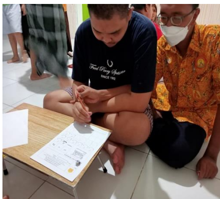
Figure 4. Completing the tracing worksheet for Arabic letters

In Figure 4, it can be seen that the students are tracing Arabic letters on the provided worksheet with the supervision of the responsible teacher. The students, who are classified as advanced with a diagnosis of autism, are directed and given instructions to stay focused while tracing. The instructions "write" and "focus" are continuously provided to ensure that the students can complete the task while working on the worksheet. The attached image in Figure 4 shows the students' work in tracing the worksheet.