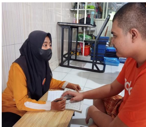
Figure 2. The teacher while teaching with the Iqra' book

In Figure 2, the student pronounces the letter pointed out by the teacher with slight stimuli, as the student is not yet consistent in certain Arabic letter materials. This can occur due to the varying levels of autism among students, which affects their learning outcomes.