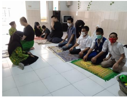
Figure 6. Congregational Prayer Activity

As seen in Figure 6, the congregational prayer activity conducted by the special needs students is quite conducive and orderly with the assistance of their respective accompanying teachers in instilling discipline among the students. This activity has an impact on the students' obedience in understanding the teacher's instructions, which will also affect the process of Quranic reading and writing learning.