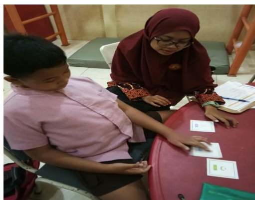
Figure 1. The teacher while teaching with flashcards

As seen in Figure 1, the research subject, who is a child with special needs, is able to consistently label and identify Arabic letters. Generally, special needs children who have reached the intermediate level of focus use the Iqra' book instead of flashcards. At this stage, the teacher no longer provides vocal imitation (imitating sounds), but the student independently and accurately pronounces the Arabic letters pointed out by the teacher. If the student is unable to recall the Arabic letters shown, the teacher provides lip-shape stimuli (Pd & Gresik, 2022). For example, if a student forgets the pronunciation of the letter "sho," the teacher will pout their lips as a stimulus for recall.